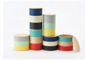
HATASHIKITEN CO.,LTD. 「col. series 'BORDER' wooden container」 YAMANAKA-SHIKKI