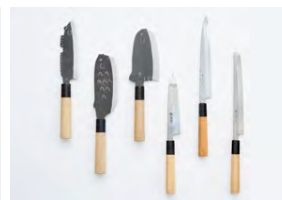
IKEDA TANRENJO SAKAI-UCHIHAMONO