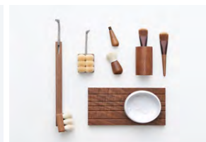
MIZUHO BRUSH CO.,LTD. 「'SUVÉ' brushing skin care」 KUMANO-FUDE