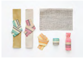
SHIGA-KEN HEMP-RAMIE TEXTILE INDUSTRIAL ASSOCIATION 「'OMI-JOFU' Placemat (Ramie and Linen)」 OMI-JOFU

To request images, please contact the public relations office shown below.