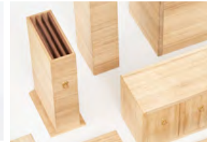
MORI WOODCRAFT 「'KEI' wooden kitchen ware」 KYO-SASHIMONO