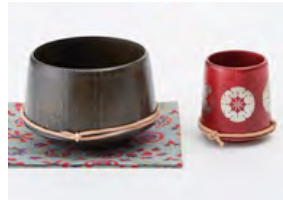
B PRIZE CORPORATION 「'NODATE-MUG' & 'KOBUKUSA'」 AIZU-NURI