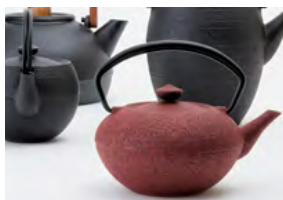
CHUSHIN KOBO CO.,LTD. 「'CHUSHIN KOBO' iron kettles」 YAMAGATA-IMONO